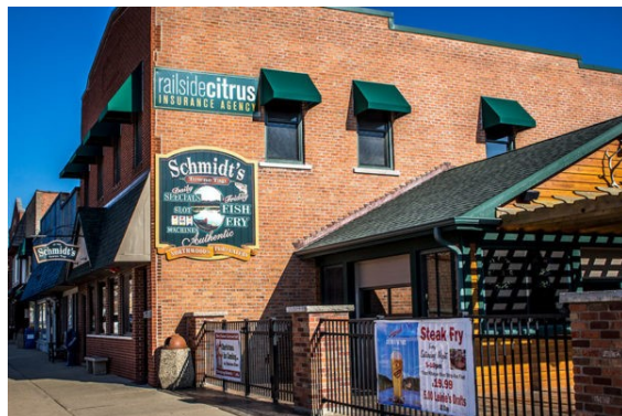
Schmidt's Towne Tap