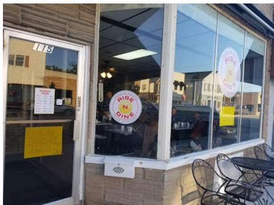
Rise N Dine